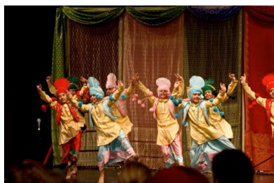
Shan E Punjab - VCD 2010