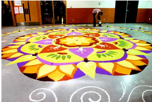
Artist Whitney Krueger builds the massive rangoli at VCD 2010

Celebrated across the world, Diwali is the biggest, brightest and most popular even in the Indian calendar. The word diwali means “row of lighted lamps”, with light symbolizing the triumph of good over evil, prosperity over poverty and knowledge over ignorance. It’s a time for lighting diyas , laying out colorful rangolis , setting off fireworks, exchanging gifts of sweets and celebrating with dance, music and storytelling.