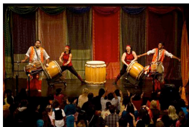
Dhol Meets Taiko – VCD 2010