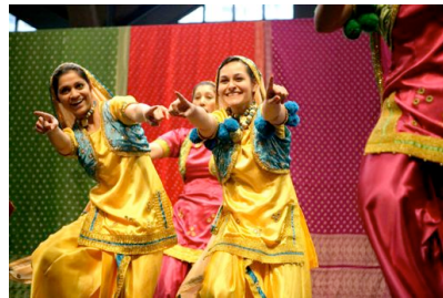
UBC Girlz Diwali Downtown 2008