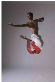
Dakshina Dance Moving Landscape 2009