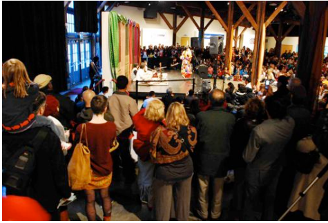
Artists performed to packed houses at VCD 2010