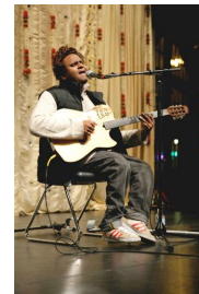
R&B Singer Chin Injeti Chai House 2008